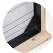
METAL UNDERSTRUCTURE (ONLY AVAILABLE ON STANDARD SIZE UNITS SHOWN BELOW)

AVAILABLE WITH 31-INCH OR 42-INCH WIDTH SEATS. FEATURES STEEL REINFORCED METAL UNDERSTRUCTURE TO SUPPORT UP TO 600 LBS.