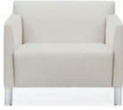
31-INCH SEAT (BARIATRIC AVAILABLE)