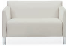
42-INCH SEAT (BARIATRIC AVAILABLE)