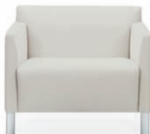
31-INCH SEAT WIDTH