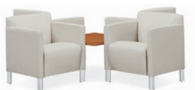
90° X LINKING TABLE