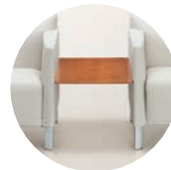
TOP-LINKING TABLES ARE BRACKET MOUNTED TO SEATING COMPONENTS.

SPECIFY STANDARD SIZE LINKING TABLES WITH STANDARD SIZE SEATING COMPONENTS AND GRAND SIZE LINKING TABLES WITH GRAND SIZE SEATING COMPONENTS. LINKING TABLES ARE AVAILABLE AS TOP-LINKING OR LEG-LINKING COMPONENTS. LEG-LINKING UNITS UTILIZE A LEG-LINKING BRACKET.