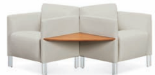
90° ARC LINKING TABLE (ONLY AVAILABLE AS A TOP-LINKING TABLE)