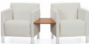
22.5° LINKING TABLE