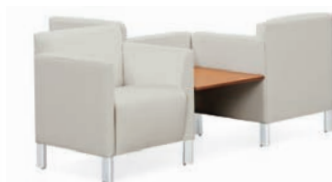
90° T LINKING TABLE