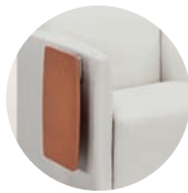
TABLET ARM IN STOWED POSITION