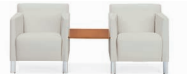
20-INCH LINKING TABLE