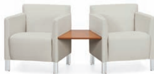
30° LINKING TABLE