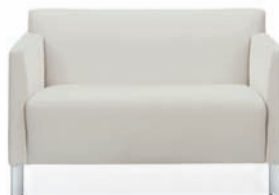
42-INCH SEAT WIDTH