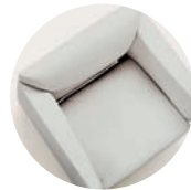
CLEAN OUT SEAT

A MINIMALLY DESIGNED CLEAN OUT SPACE AT THE BACK AND SEAT JUNCTURE ALLOWS FOR DIRT AND SPILLS TO BRUSH THROUGH TO THE FLOOR FOR QUICK AND EASY CLEANUP WITHOUT INTERRUPTING THE CLEAN LINES AND AESTHETIC OF THE HEDRON CHAIR DESIGN.