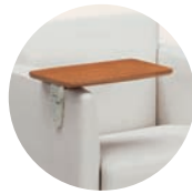
TABLET ARM IN RIGHT POSITION

TABLETS FEATURE A TILT AND STOW MECHANISM THAT ALLOWS FOLD DOWN STORAGE WHEN NOT IN USE. TABLETS PIVOT 90°, AND ARE SIZED TO ACCOMMODATE THE LATEST TECHNOLOGY, AND MAY BE SPECIFIED AS RIGHT OR LEFT.