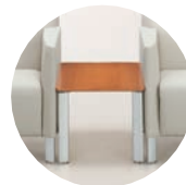
LEG-LINKING TABLES ARE TABLE LEG SUPPORTED