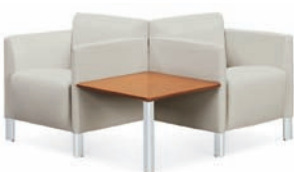
90° L LINKING TABLE