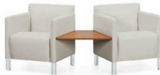
45° LINKING TABLE