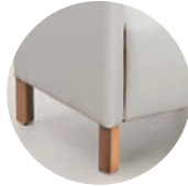
VENEER WRAPPED LEG