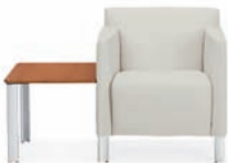
20-INCH END TABLE