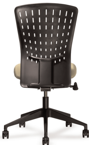
Exposed Back Swivel Tilt, Armless Model: SC42100-K345/17