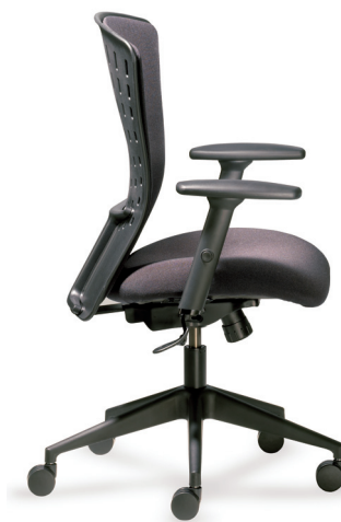
Full Upholstered Pad Swivel Tilt, Height/Articulating Arm Model: SC42116FP-K345/10