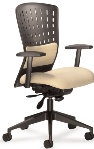
Lumbar Pad, Knee Tilt, Fixed Arm Model: SC47107LP-4402